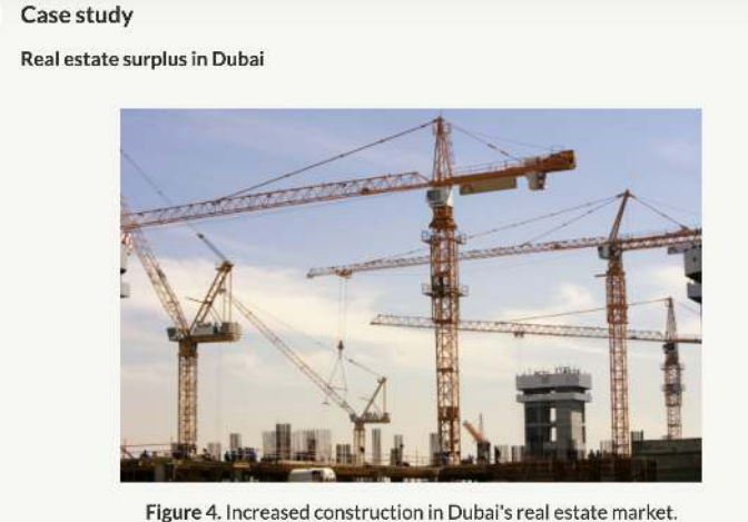
Figure 4. Increased construction in Dubai's real estate market.

The city of Dubai in the UAE is a popular destination for tourists. Dubai is also a free port and has no restrictions on trade. It attracts a variety of businesses, from start-ups to multinational companies.